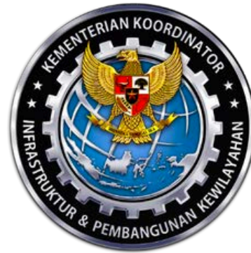
Coordinating Ministry for Infrastructure & Regional Development