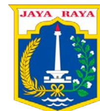
Jakarta Provincial Government