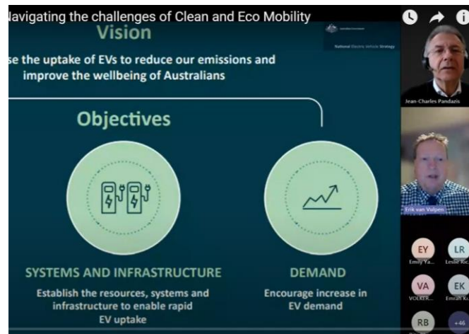
2 nd webinar