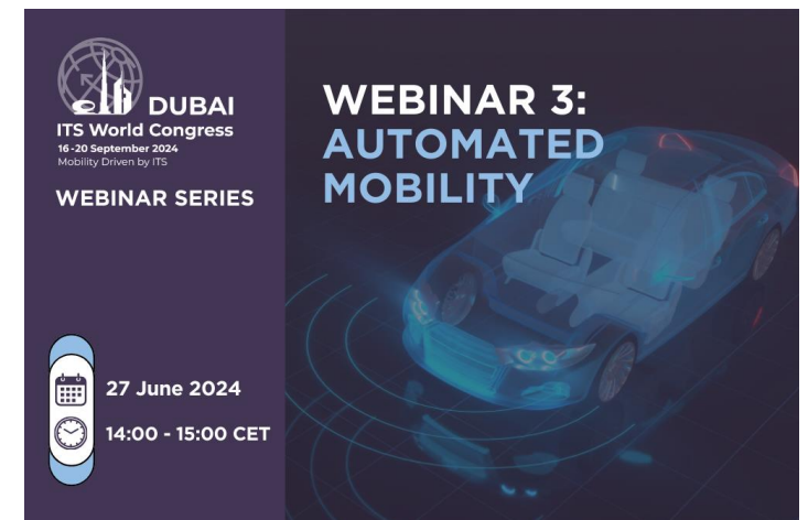
3 rd webinar